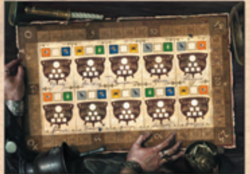
1 Compendium (Game Board)

160 Ingredient Cubes (32 wooden blocks in each of 5 colors):